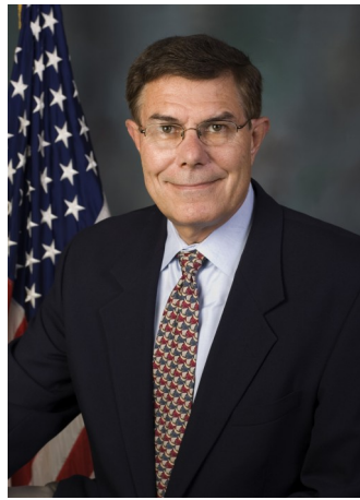
Rep. Russ Fairchild